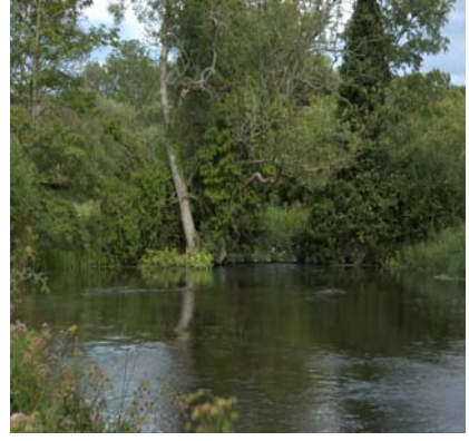
EEL BRIDGE POOL