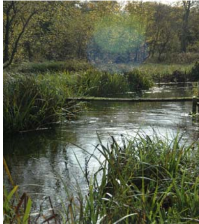
WILLOW TREE STREAM

As the river turns sharp left the beat becomes more of a stream as the water splits in two. The Willow Trees stream is usually good for some small wild fish and the stream will shortly bring you back to the Dog Leg Hut.