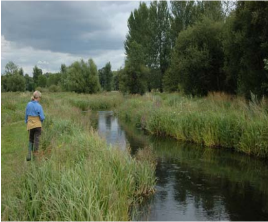
VIEW FROM ELM STREAM BRIDGE