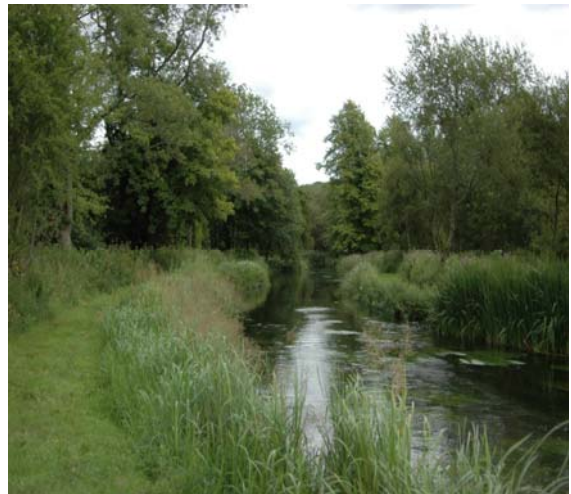
VIEW FROM EEL BRIDGE